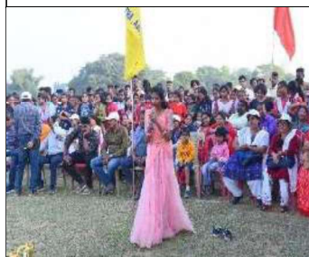
FANCY DRESS COMPETITION