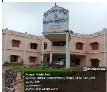
PHYSICAL EDUCATION DEPARTMENT