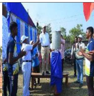
ANNUAL ATHLETIC MEET