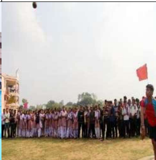
PUTTING THE SHOT